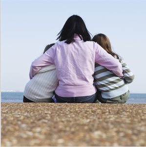
You'll need to find competent advice to help you through this difficult time.